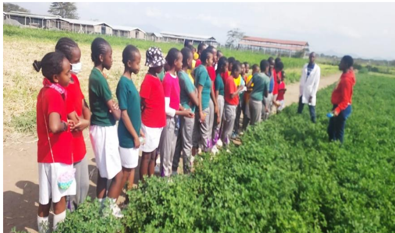
Grade 6 @ Kalro