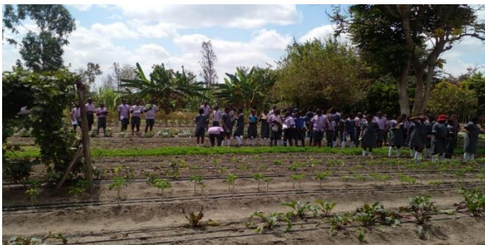
Grade 5 @ Fred's ranch