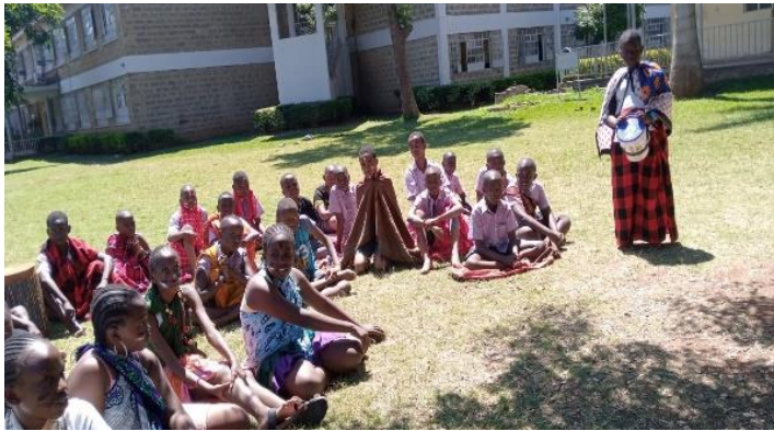
Grade 3 and 5 ILA project