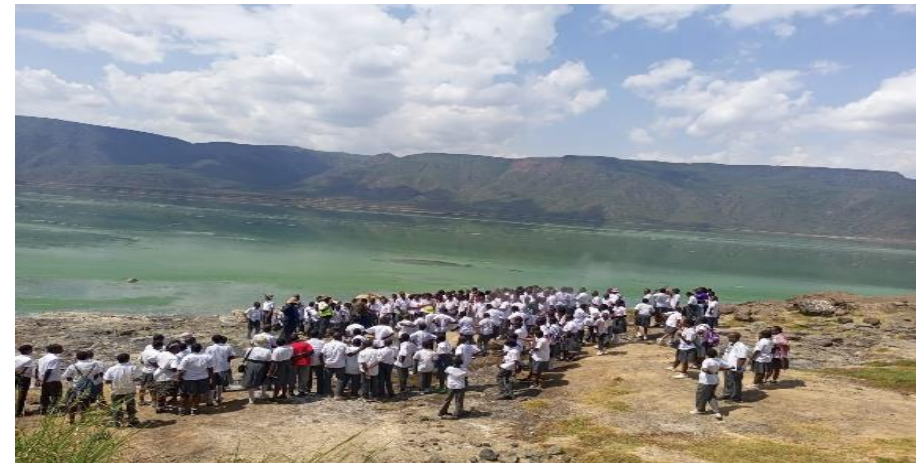
Grade 7 @ Bogoria