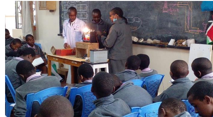
Grade 8 @ science Practica.